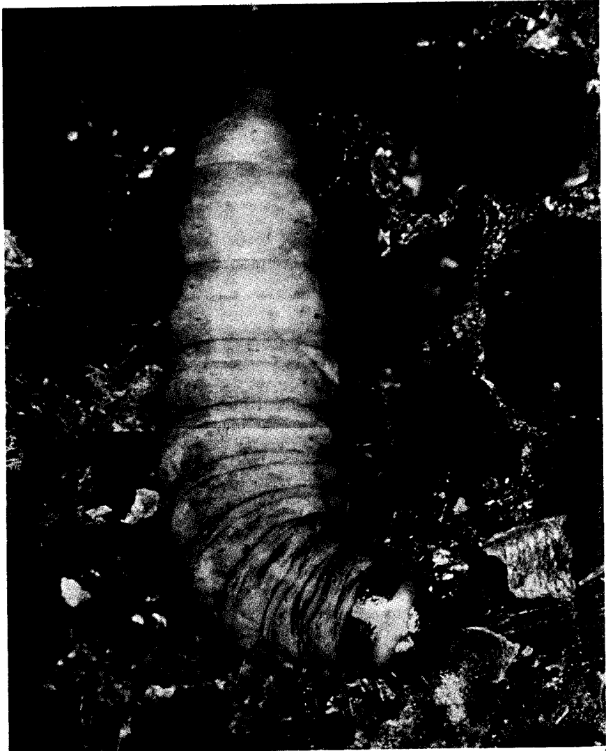
Wax moth larva